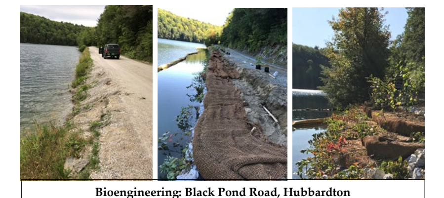
Agency of Natural Resources, Department of Environmental Conservation