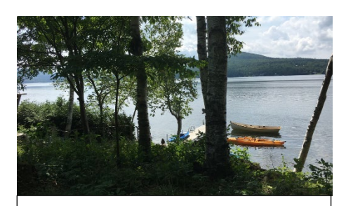
Shoreland Permitting Preserves a 100 Foot Wide Shoreland Buffer

The Shoreland Protection Act (SPA) requires permitting review for any projects that increase impervious surface or clear native vegetation within 250 feet of the mean water level on lakes greater than 10 acres in size. About 440 lakes from 811 lakes and ponds total in Vermont are greater than 10 acres in size.