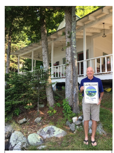
Lake Wise Award for Exemplary Shoreland Management

Projects to restore living shorelands has resulted in the first successful Bioengineering Projects installed along Vermont lakeshores. More than 12 projects have been installed, offering hands-on trainings for NSECC contractors. These softscape stabilization methods, using biodegradable products, native plants, and other natural materials will be featured as Case Studies in the 2021 Vermont Bioengineering Manual.